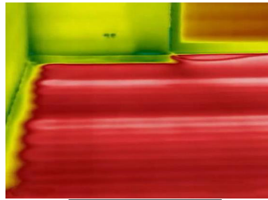
50mm Gyvlon Screed